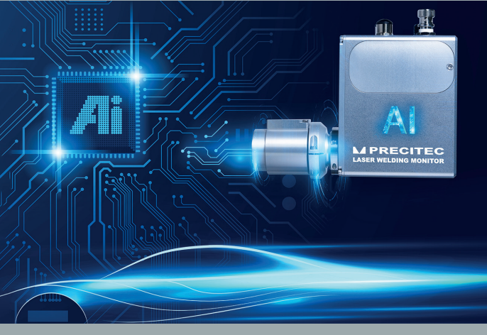
Al embedded Laser Welding Monitor LWM.