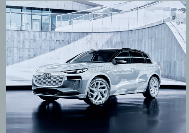
Audi Q6 e-tron. © AUDI AG.