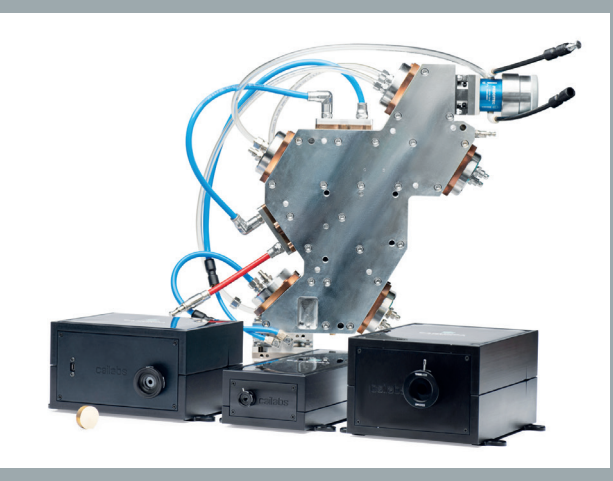
CANUNDA off-the-shelf Products for micro and macro