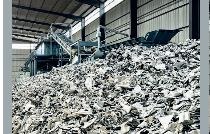
Cleaning, analysing and sorting scrap metal in a single step,

Sorting machine for direct recirculation, © cleansort GmbH.